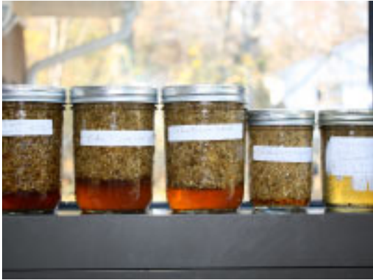
elderflower syrup | Diane Mateo

In this fast paced culture of quick fixes, herbal remedies are being marketed in highly concentrated, standardized pills and liquids, as replacements for pharmaceuticals. Making your own herbal remedies from the whole plant is simple and for the same price as a store-bought preparation, you could make enough for you and many more. By preparing herbal remedies for yourself and your circle of friends and family, you are continuing a long history of using herbs for food and medicine. You are taking your health and healing into your own hands and encouraging self- and community-sufficiency, which is incredibly empowering. Also, when you make remedies by hand, you are infusing these remedies with your love and intention, which will make good, strong medicine.